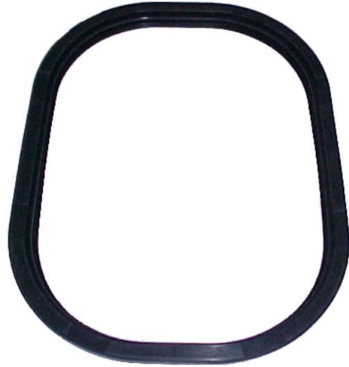
Cabin Window Seal

Eligibility: DC-9, MD-80 & MD-90 Aircraft