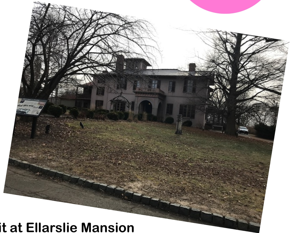
January Watercolor Exhibit at Ellarslie Mansion