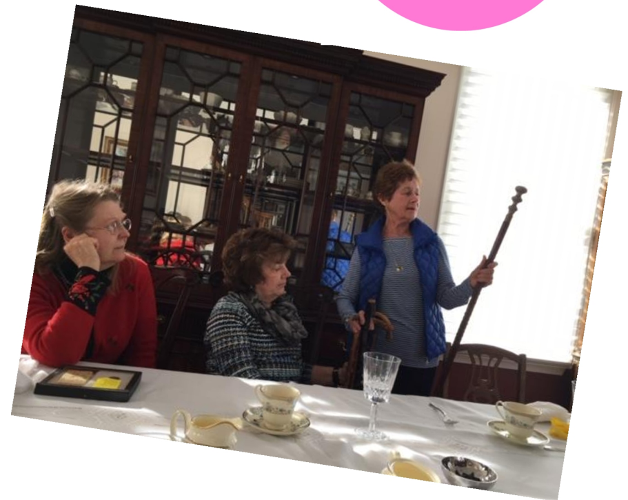
One member discussed her extensive cane and walking stick collection.