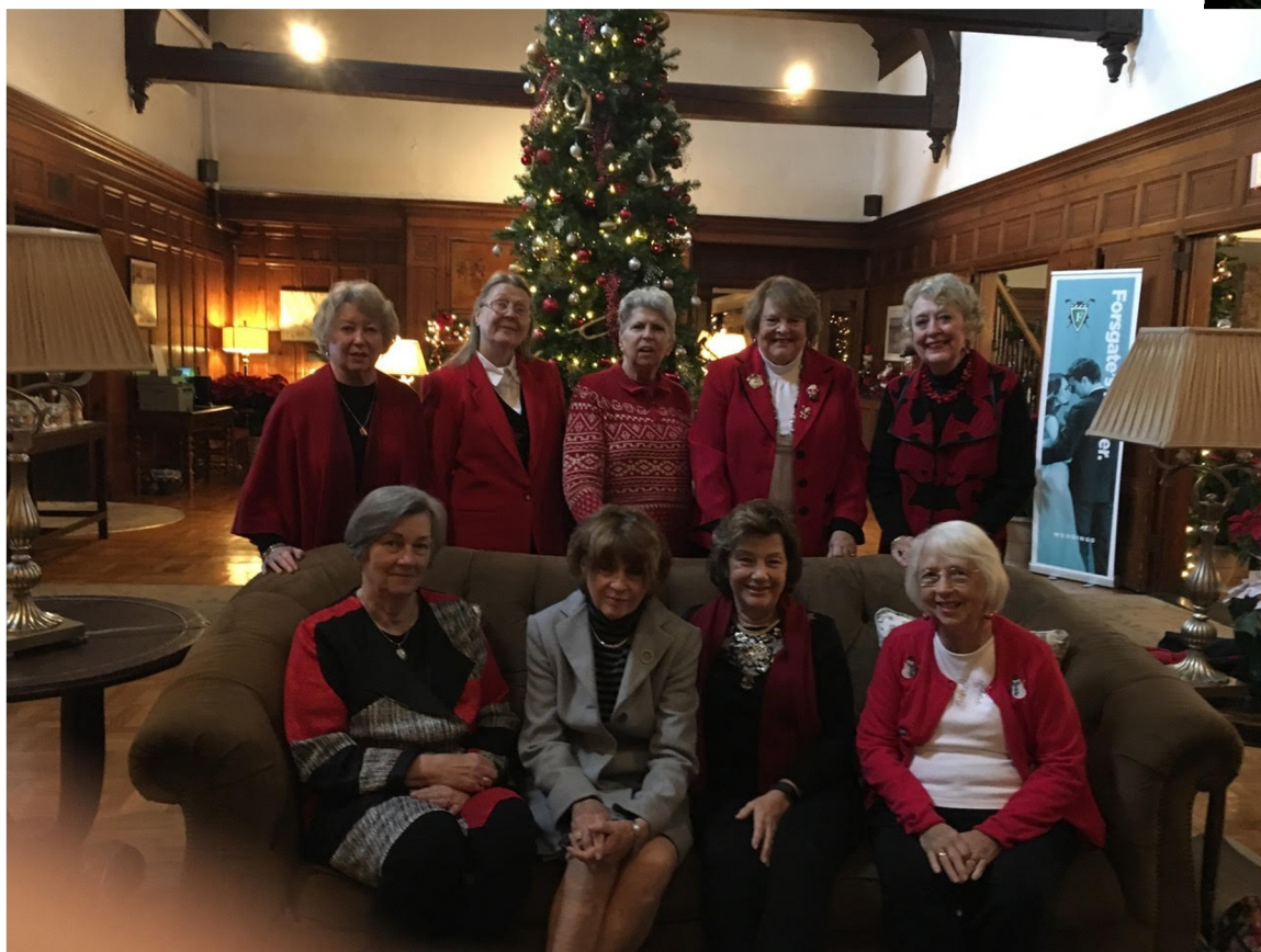
Foresgate Country Club Holiday Party December 20