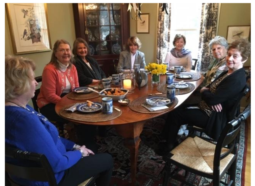
Discussions over coffee in Cranbury, March