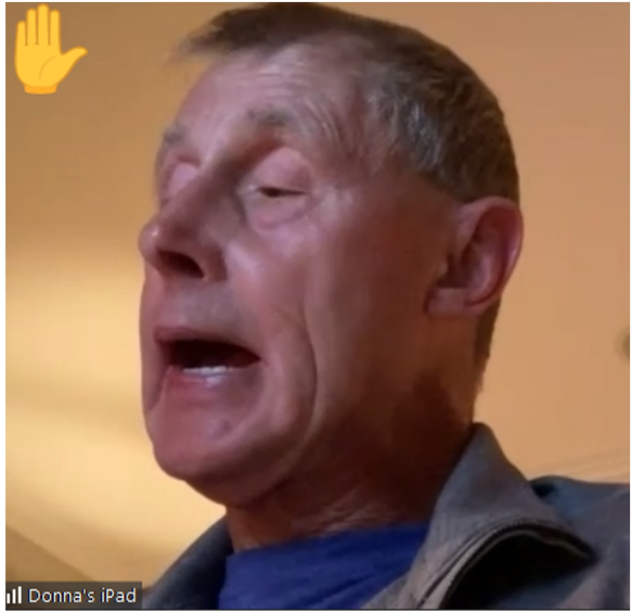
A question from the floor