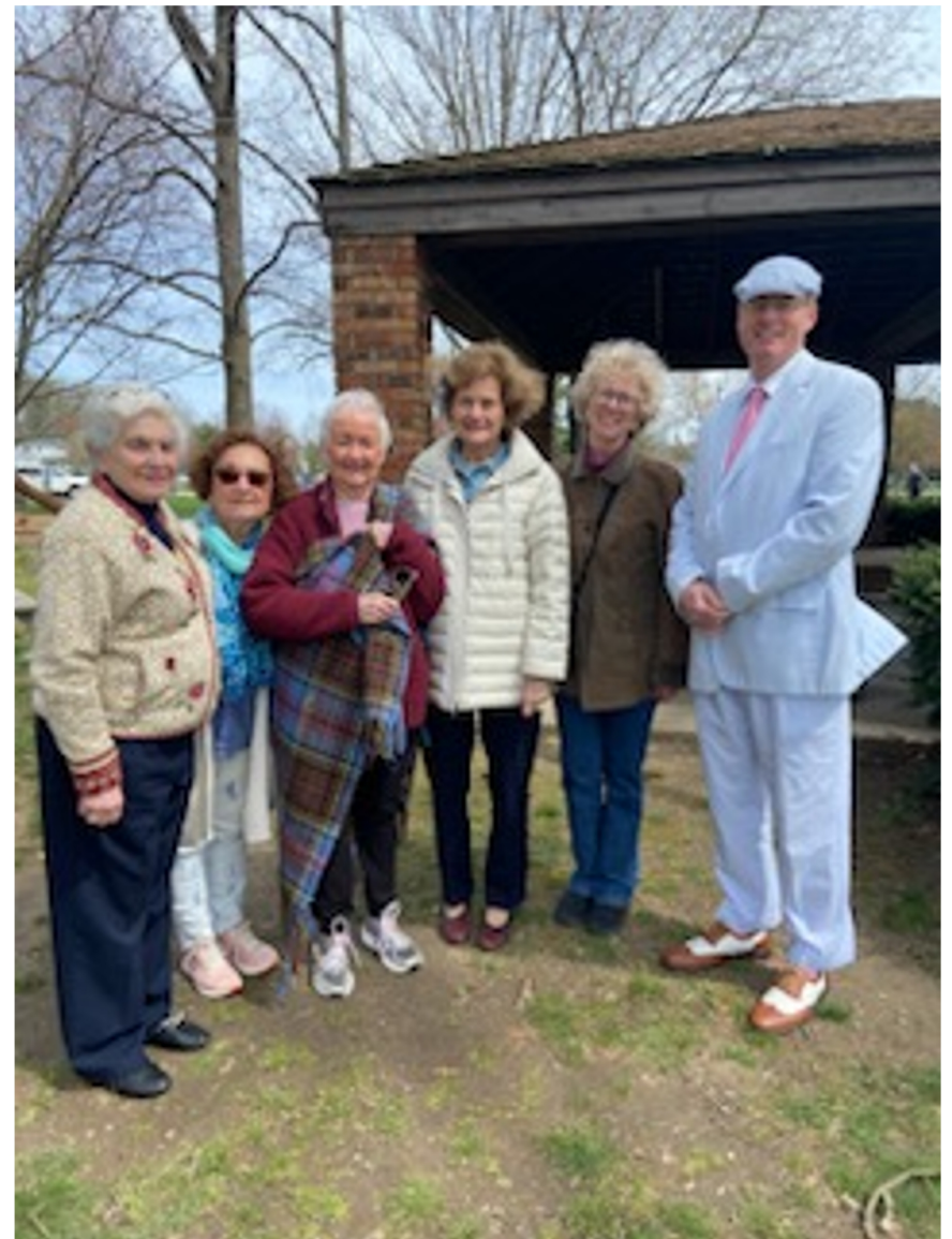
Waiting for the hunt to begin.