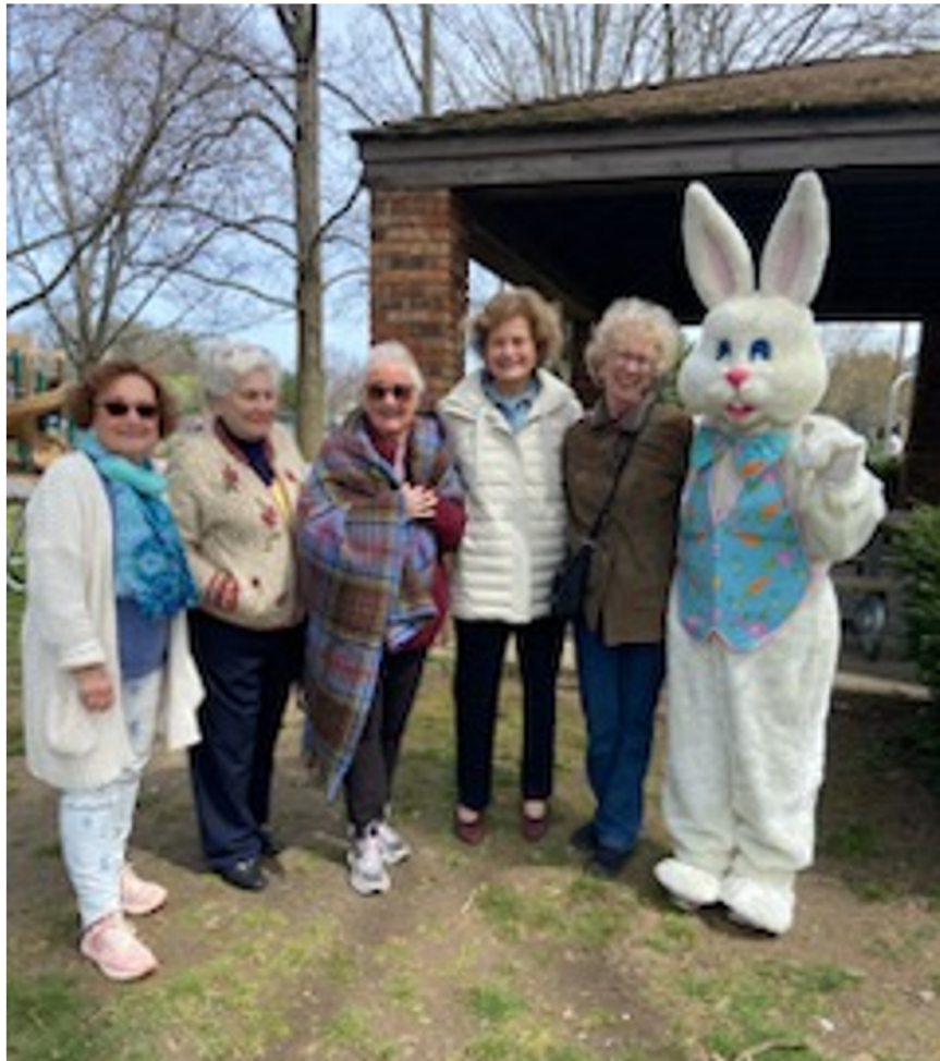
Our intrepid egg hiders.