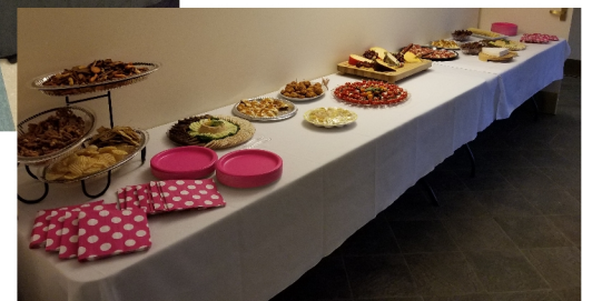
Excellent food and drinks were served.