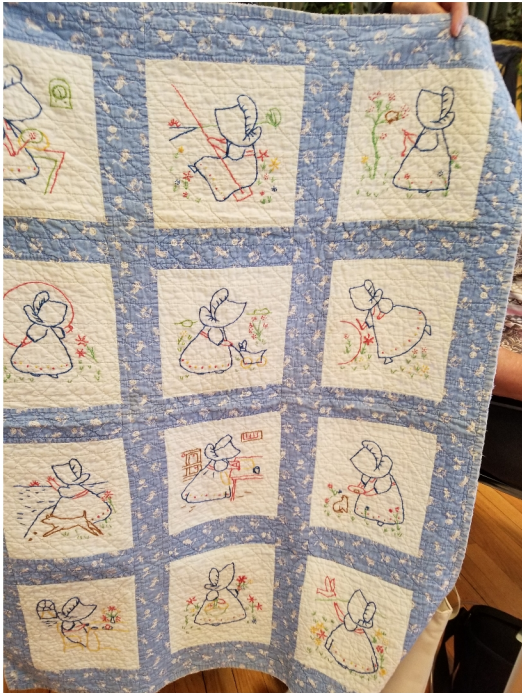
Her Mother's Blue Sun Bonnet Quilt