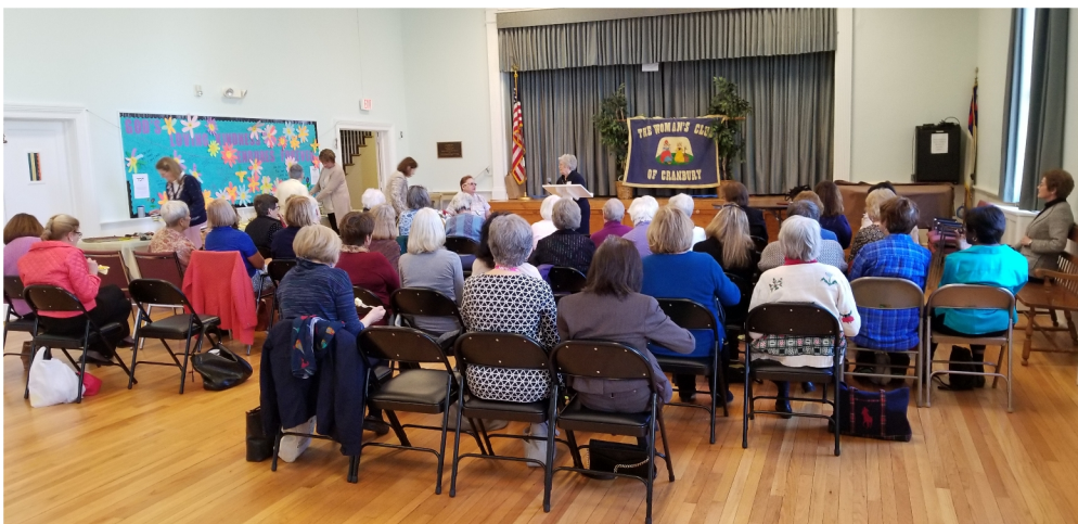
Drama & Literature Hosts - April 3, 2018 The Underground Railroad Quilts