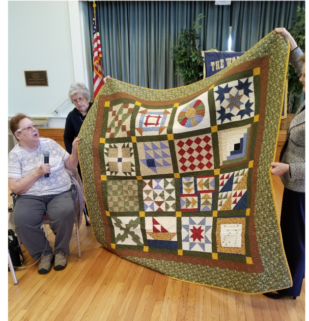
Carol's Underereground Railroad Quilt