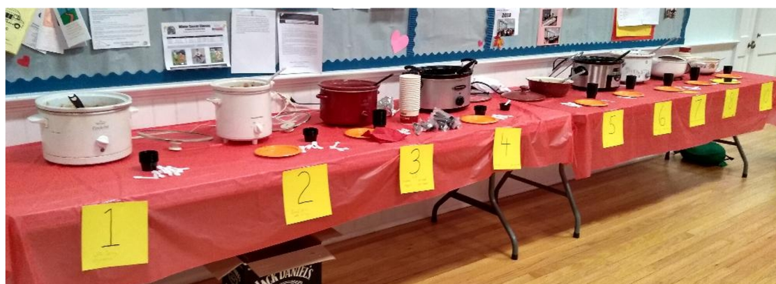
Nine chili dishes competed for top prize.