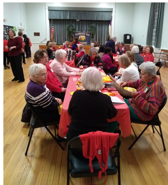
Chips, corn bread, sour cream, scallions and cheese toppings and desserts. Yum!