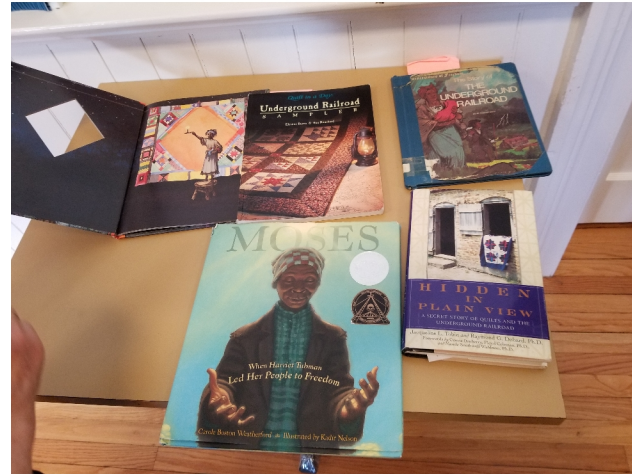
A display of books about Harriet Tubman and the Underground Railroad.