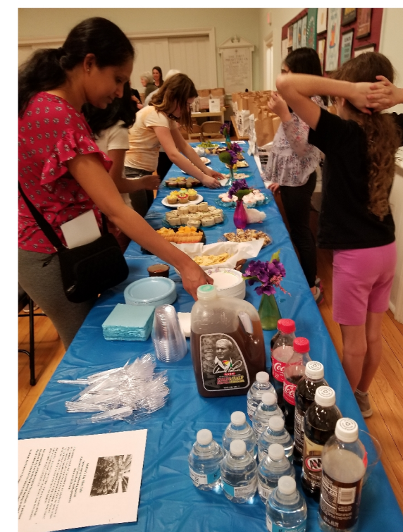
21 members attended, 1 guest, 8 girls scouts, and 3 mothers.