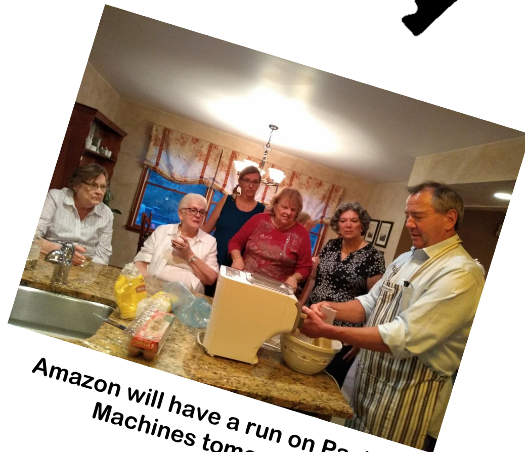
Amazon will have a run on Pasta Machines tomorrow