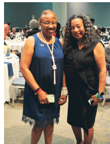
More pictures featuring chapter members attending in the Alumni Banquet at commencement!