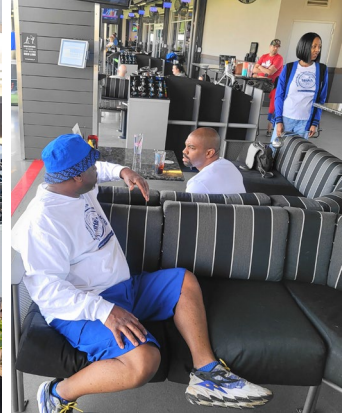
Although the chapter unfortunately got jerked around, members still enjoyed great fun, food and company!