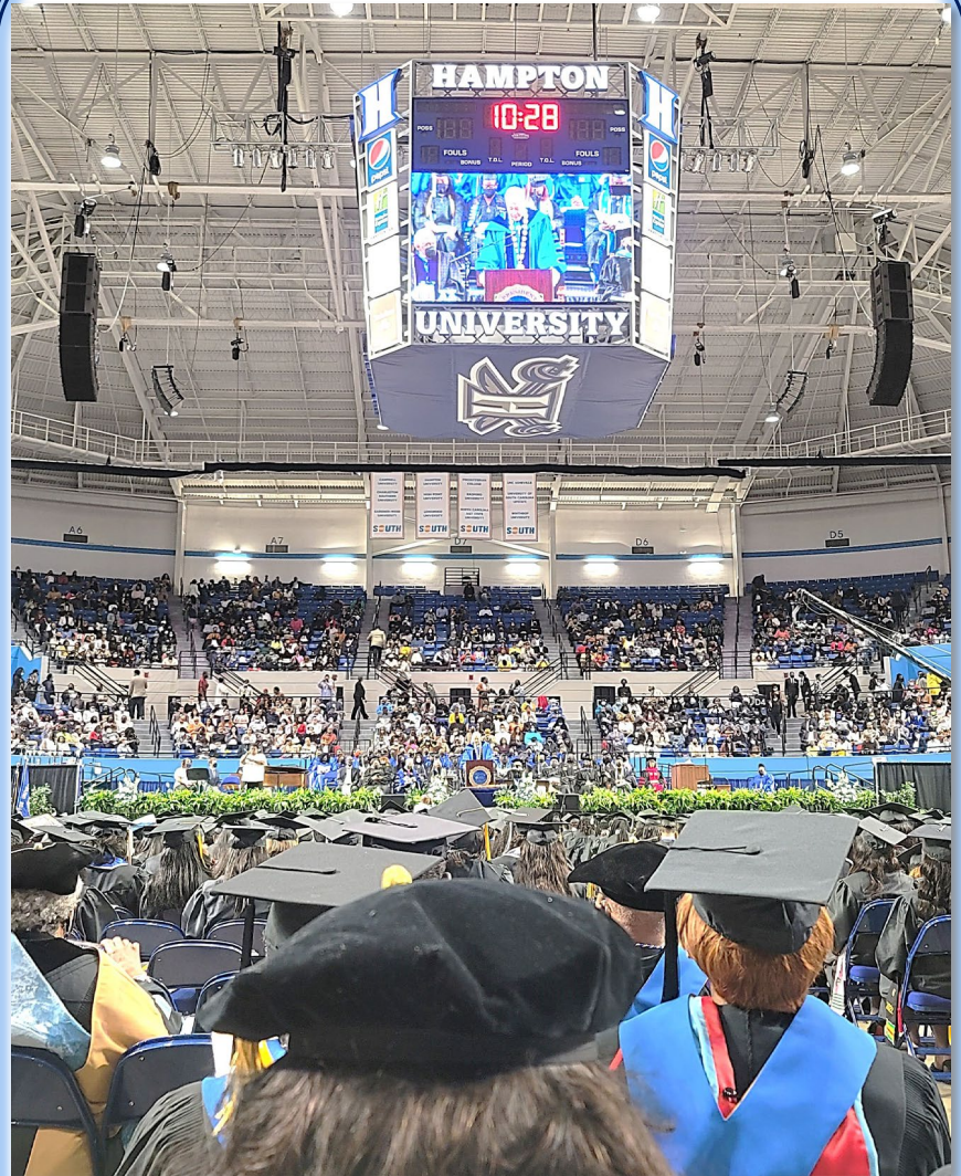
The 152 nd Annual Commencement at Hampton University