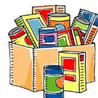
Feeding the Community