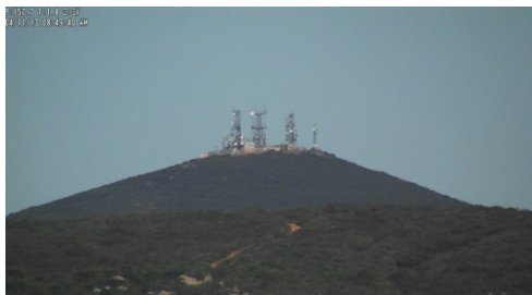
720p 30x Full Zoom