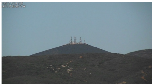
720p 18x Full Zoom