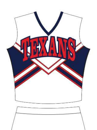
B. SHELL SH214V LETTERING TW25-2 SKIRT SK306 BRAID A50-D1-F2