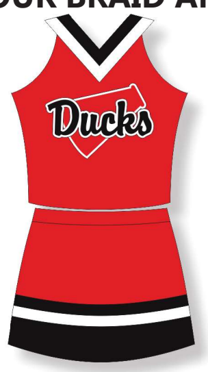
F. SHELL SH203 LETTERING TWSP-07 SKIRT SK315 BRAID B2