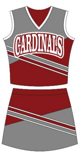
F. SHELL SH266 LETTERING TW19-3 SKIRT SK366 BRAID A50-F2