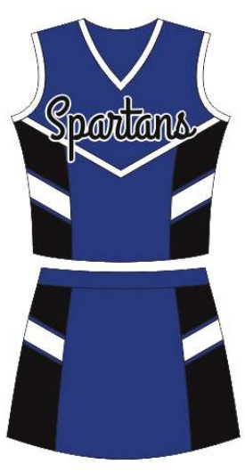
G. SHELL SH267 LETTERING TW28-2 SKIRT SK367 BRAID A50