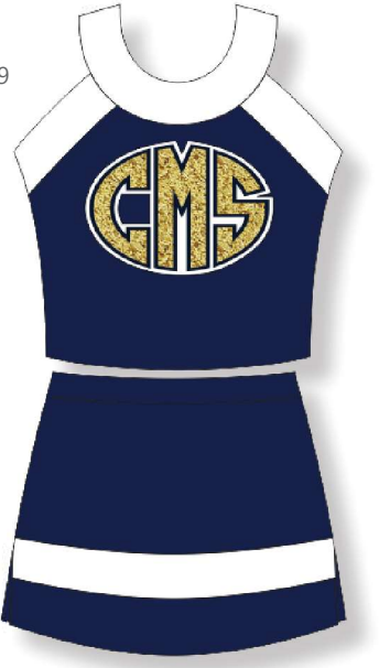
B. SHELL SH238 LETTERING TW14-02 SKIRT SK323