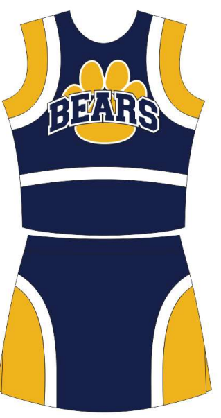
D. SHELL SH226 LETTERING TWSP-01 SKIRT SK320 BRAID A1