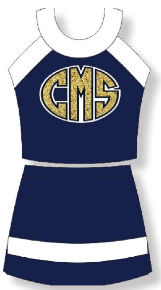
C. SHELL SH240 LETTERING TWSP-09 SKIRT SK350