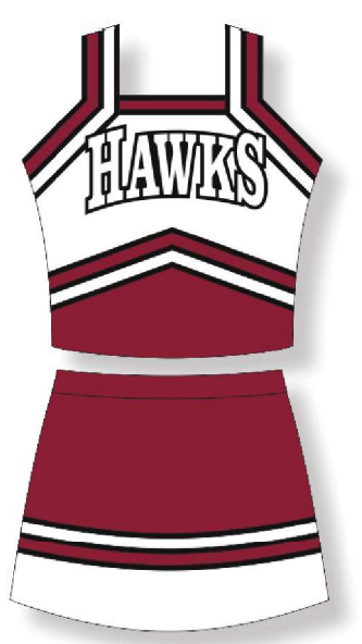
A. SHELL SH229 LETTERING TW26-2 SKIRT SK315 BRAID D1-F2