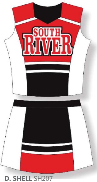
LETTERING TWSP-05 SKIRT SK363