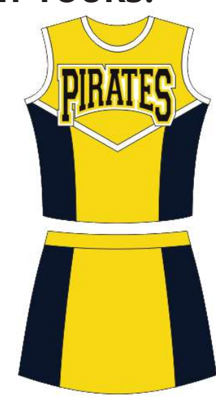
H. SHELL SH263 LETTERING TW01-3 SKIRT SK360 BRAID A50