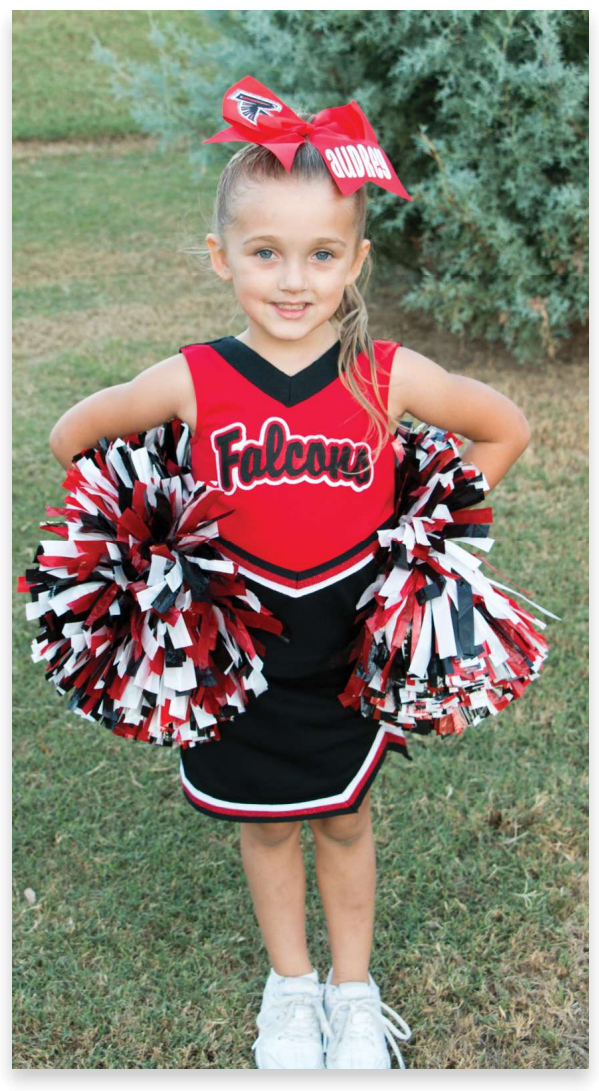
SHELL SH201 LETTERING TW07-03 SKIRT SK307 BRAID A1-C1