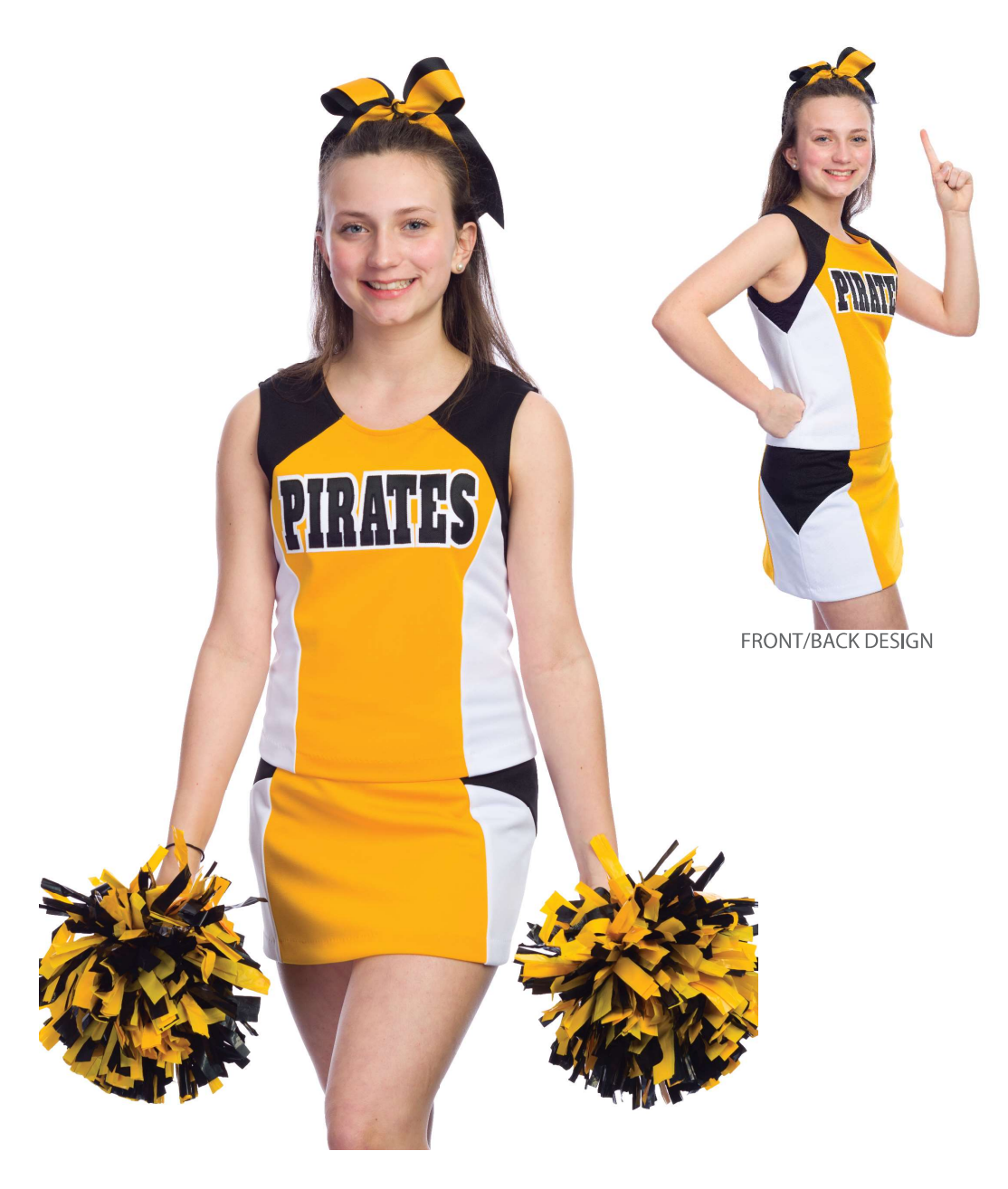
A. SHELL SH237 LETTERING TW18-2 SKIRT SK359