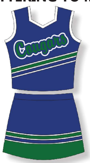
G. SHELL SH220 LETTERING TW06-3 SKIRT SK315 BRAID A5-F2