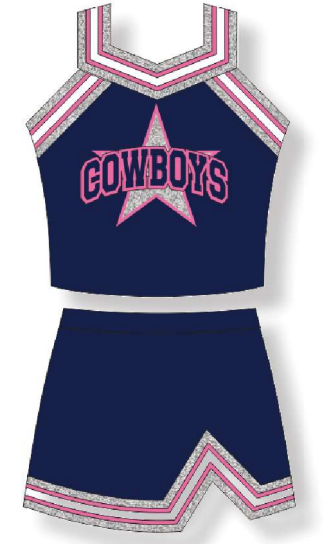
E. SHELL SH206 LETTERING TWSP-08 SKIRT SK307 BRAID E2