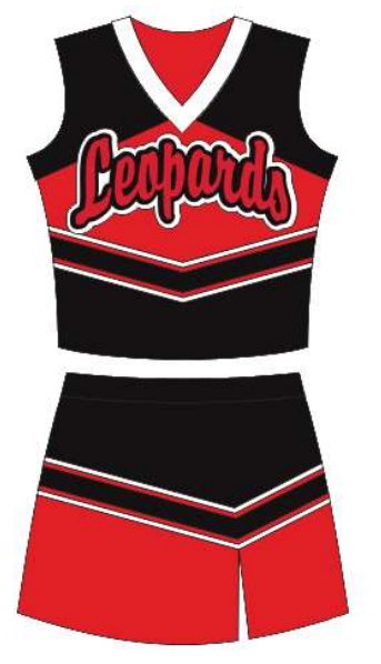
C. SHELL SH264 LETTERING TW07-3 SKIRT SK327 BRAID A1-F2