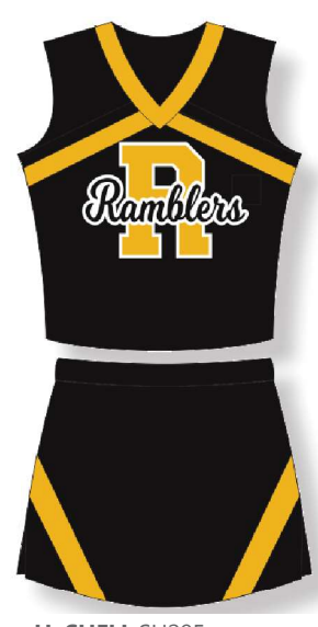
H. SHELL SH295 LETTERING TWSP-08 SKIRT SK348 BRAID A1