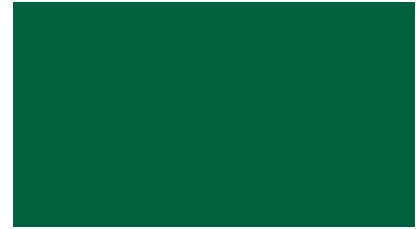
Safety Green / 613