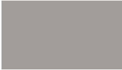
Driftwood / 128

Available in 9200, 9300, 9500, 9700 & 9750