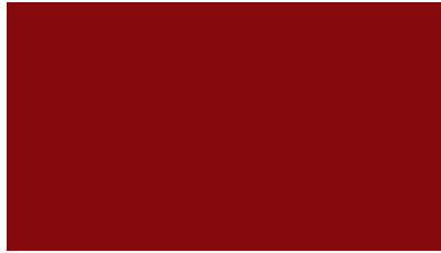
Tile Red / 316