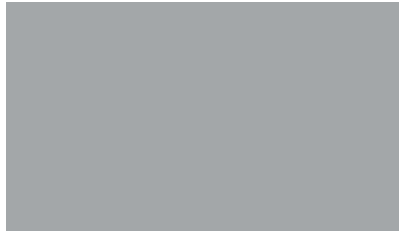
Silver / 136

Available in 9200, 9300, 9500, 9700 & 9750