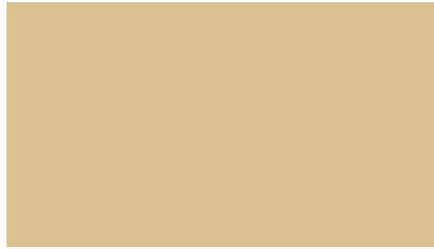
Desert Tan / 135

Available in 9200, 9300, 9500, 9700 & 9750