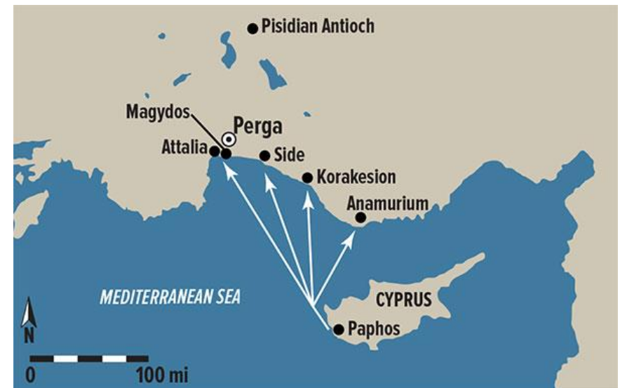
Biblical Archaeological Society map

22 After removing Saul, he made David their king. God testified concerning him: “I have found David son of Jesse, a man after my own heart; he will do everything I want him to do.””