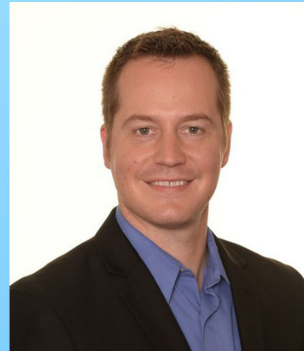
Founder and CEO

We provide high-quality and affordable tutoring – through individual and group tutoring, we personalize lessons to make sure employees are advancing quickly and successfully in their English skills.