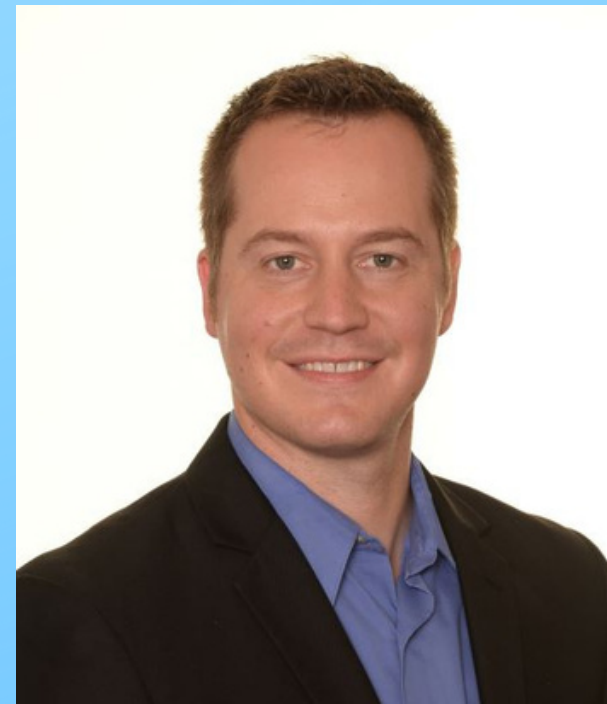
Founder and CEO