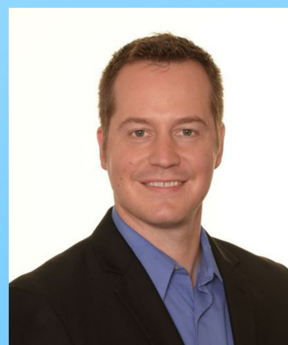
Founder and CEO