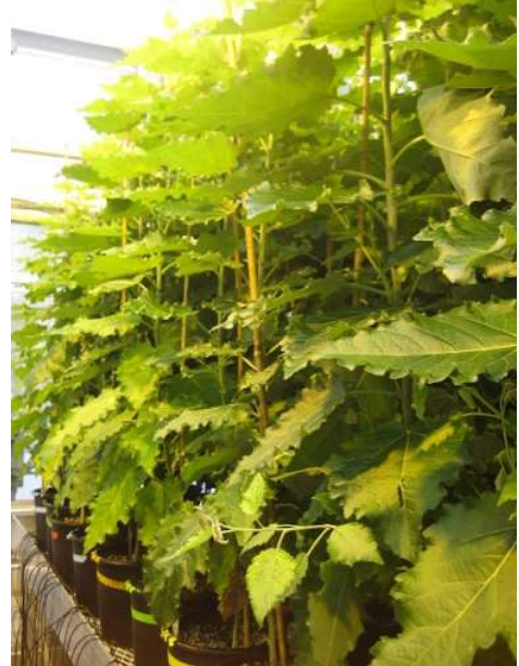
Poplar Trees in Syracuse University Coleman Lab Greenhouse

ethanol-induced promoter require an ethanol spray to produce Rep and transcribe \beta -glucosidase. This inducible system allows for higher levels of enzyme accumulation in poplar leaf and stem tissue.<sup>3</sup> The transgenic trees were grown in the greenhouse alongside positive controls lacking the split-gene configuration and negative controls lacking the ethanol-induced promoter system. Samples were collected for analysis on Day 0, Day 5, and Day 9, with ethanol being applied to the plants on Day 1.