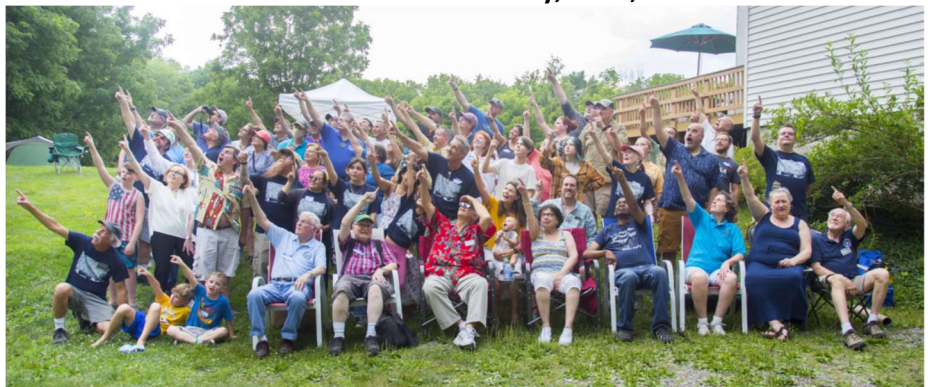
Attendees at RocheStar Fest 2022 The Astronomy Section of the Rochester Academy of Science (ASRAS) will hold the 26th annual RocheStar Fest on July 14th to July 6th. This weekendlong event features astronomy, lectures, demonstrations, and camping at ASRAS's Ionia, NY observing grounds. A picnic dinner will be held on

July 14 – 16, 2023, Marian and Max Farash Center for Observational Astronomy, Ionia, NY.