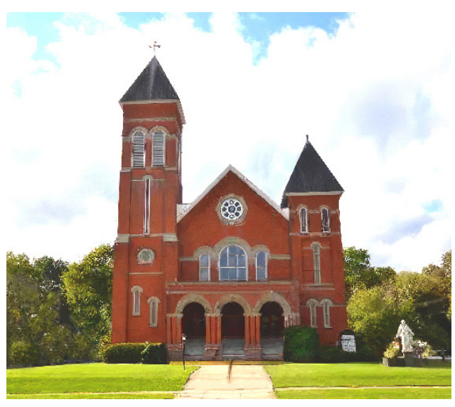
First Lutheran Church, Lyons, New York LC-I Headquarters Church and Archbishop's Office