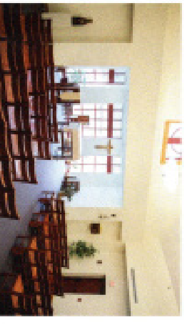
Guest House Chepe?