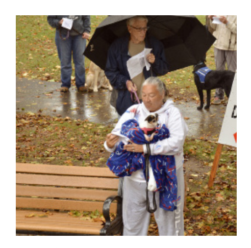
This person's pet is a blessing!