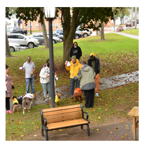
People and animals enjoy fellowship in the park.