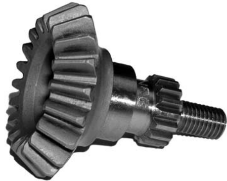
Main Oil Pump Gearshaft

Eligibility: JFTD12A-4A/-5A Series Engines