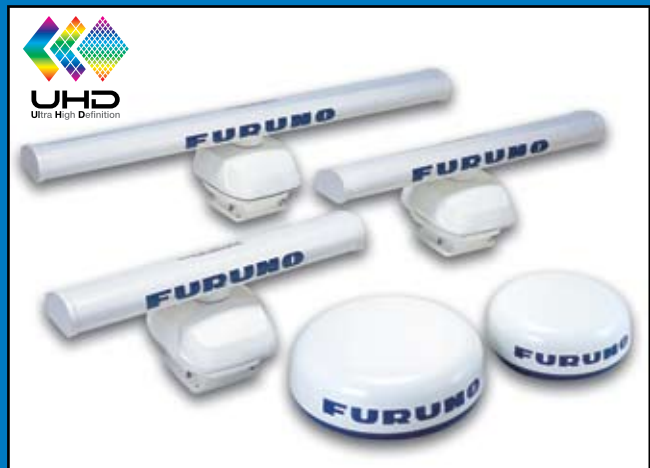
UHD™ offers crystal clear, noise-free target presentation with automatic real-time digital signal processing. Antenna rotation speed (24/36/48 rpm) is automatically shifted to the appropriate pulse length.

One amazing features of Furuno UHD Digital Radar is 'Real Time' dual range Radar display. NavNet 3D simultaneous scanning technology allows dual progressive scan to display and update two Radar pictures, both long and short range, at the same time as opposed to the alternating update methods of typical conventional dual range Radars. This can be used to have one screen with the gain set to locate birds and buoys, while you use the other Radar screen to navigate.