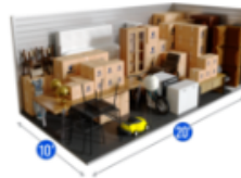
Yukon Rd - Drive Up (10 x 20)

Your rental will automatically renew each month until you decide to move out.