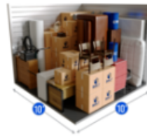
Yukon Rd - Drive Up (10 x 10)

Your rental will automatically renew each month until you decide to move out.