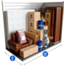
Yukon Rd - Drive Up (5 x 10)

Your rental will automatically renew each month until you decide to move out.