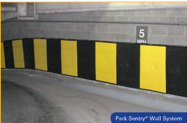
Park Sentry® Wall System

The Park Sentry Wall System provides a tough layer of protection to walls vulnerable to vehicle collision damage. Easy to install, the wall system adheres to the space using pre-mounted wall clips. Park Sentry products combine the scratch resistant properties of surface protectors with energy absorbing materials to form a comprehensive damage reduction system.