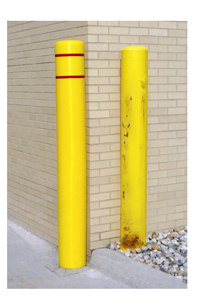
So easy a 5 year old can do it!