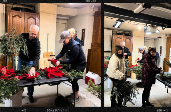
HANGING OF THE GREENS