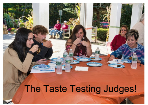
The Taste Testing Judges!