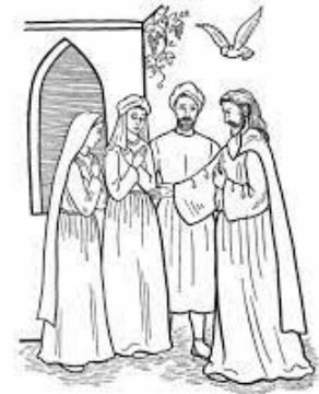
At Bethany, Jesus had many friends. He visited often with Mary and Martha, and their brother, Lazarus.

Towards the end of July, we celebrate the feast of Saints Martha, Mary, and Lazarus. These three siblings were evidently close friends of Jesus. He came to their home as a welcomed guest.