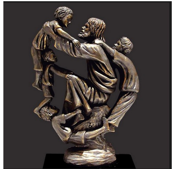
Precious in His Sight

“Rejoice in the Lord always, again I say rejoice...”