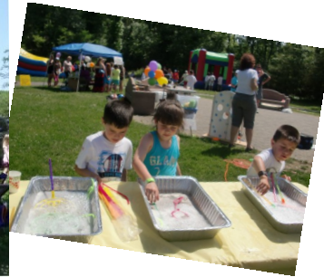
A thousand people were there!

I/We will attend the 30th Anniversary Parish Picnic on June 10th!