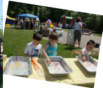
A thousand people were there!

I/We will attend the 30th Anniversary Parish Picnic on June 10th!