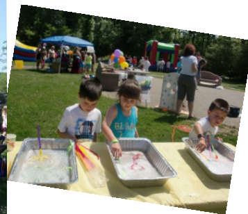
A thousand people were there!

I/We will attend the 30th Anniversary Parish Picnic on June 10th!