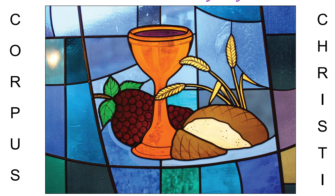
Take and drink, this is my blood ...