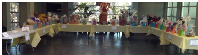
Above: The Raffle Baskets on display in our Atrium

On November 20, the Holy Cross Fund Raising Committee hosted its annual basket raffle. Various committees, parish groups and individuals donated baskets to be raffled. This year there were thirty baskets available to win.