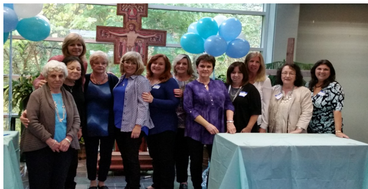
Pictured above is last year's Women's Enrichment Day