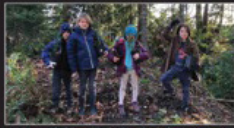
Volunteers helping with planting. Thanks for your support!

Funding and in-kind support for this project were provided by the Conservancy Hornby Island, Fisheries and Oceans, Pacific Salmon Foundation, the Wardle Family, Comox Valley Community Foundation, Fanny Bay Enhancement Society, Hornby Island Community School, Current Environmental Ltd., Hybrid Projects, Redpine Consulting, Middle Mountains Mine and Hornby Island Community Fund Society.