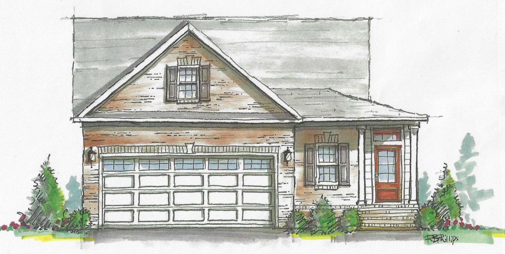
Colonial Homecrafters, Ltd.