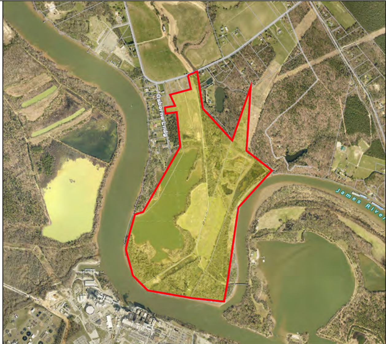
Title: Newstead landing aerial