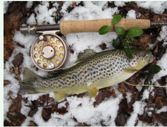
Meadow Run brown trout

Chestnut Ridge Trout Unlimited Chapter #670 P.O. Box 483 Uniontown, PA 15401