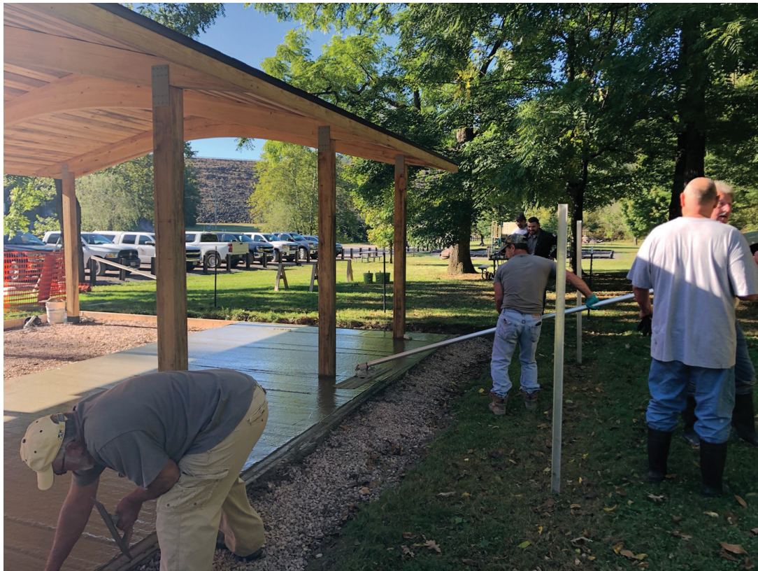
CRTU volunteers finish the concrete floor poured in the U.S. Army Corps of Engineers new picnic pavilion at Youghiogheny Reservoir tailrace. The Youghiogheny dam can be seen in the background.

CRTU has many partners with which we work to restore streams, educate youth, promote fishing, and simply encourage people to get out and enjoy the outdoors. Our chapter's belief is that getting outdoors can be a person's first step toward developing a personal commitment to conservation—and maybe learn to fish along the way.