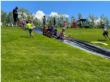
Youth slipping and sliding at Evans Park

Pints in the Park and Arts and Crafts Festival (featuring the Community Rodeo) – Come on out to Casey Jones Park on 9/23 from noon to 10pm for a full day of fun with friends and neighbors. The Elizabeth Chamber of Commerce has partnered with the Stampede to host this event which includes horseshoe and cornhole tournaments, craft beers, live music, a variety of arts and crafts vendors, and even a rodeo performance. Attendance to the event is free. Hope to see you there.