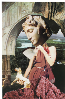
General Meeting March 10. Program on Collage