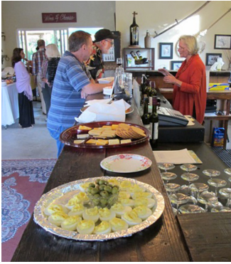
LAA/PAL Potluck & Social was held on September 14. Thanks to Charles R Winery for hosting the event.