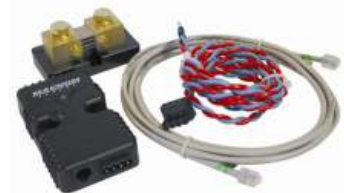
Battery Monitoring Kit