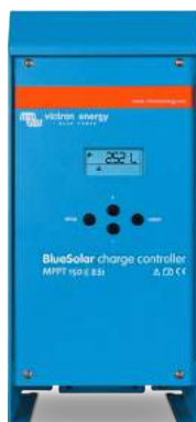
Solar Charge Control