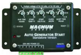
Auto Generator Start