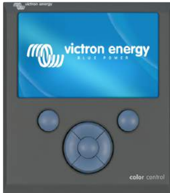
Color Remote Control