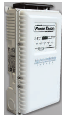
Solar Charge Control