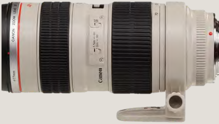
Canon EF 70-200mm f/2.8L IS II 60,000 - 90,000 UGX