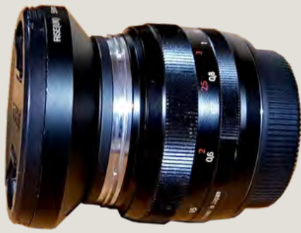
Super Takumar 50mm F1.4