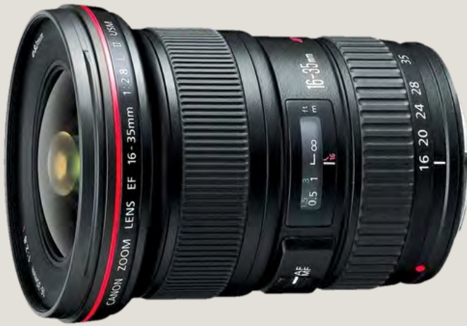
Canon EF 16-35mm f/2.8L 50,000 - 70,000 UGX