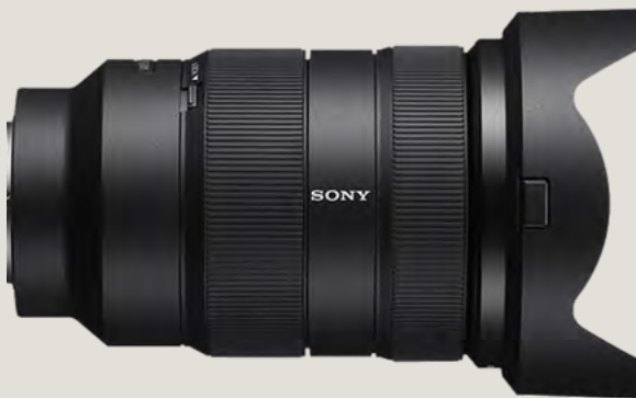
Sony FE 24-105mm f/4 G OSS Lens 50,000 - 70,000 UGX