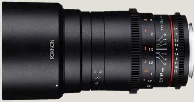
Samyang 135mm T2.2 Cine DS 50,000 - 70,000 UGX