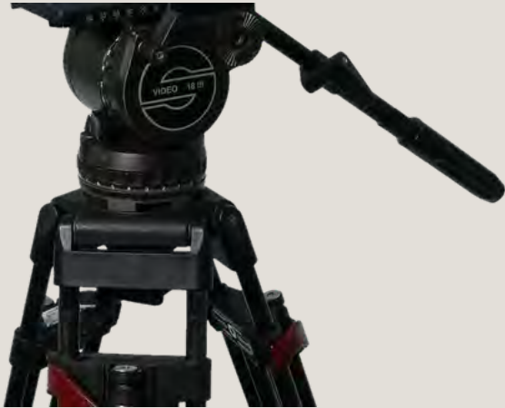
Sachtler P18 100,000 UGX

Sachtler Video 18 features the ability to support a full ENG Rig with up to 20 kg (44.1 lbs) while offering a super smooth drag performance for decades, the sturdy fluid head