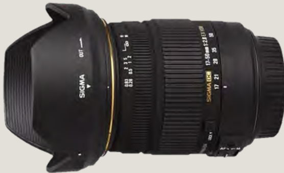
Sigma 17-50mm f/2.8 EX DC OS HSM