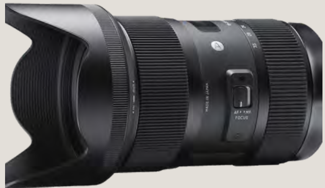
Tamron 28-75mm f/2.8 Di III RXD