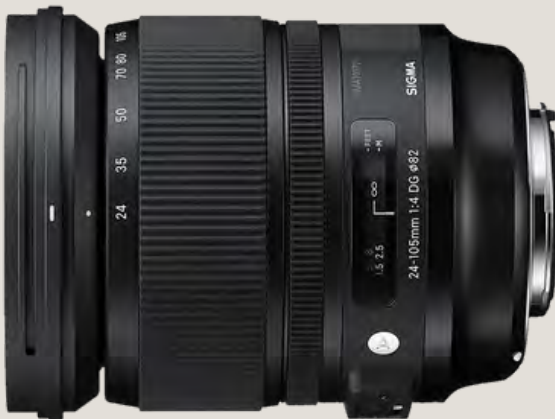
Sigma 24-105mm f/4 DG OS HSM Art 50 - 70,000 UGX