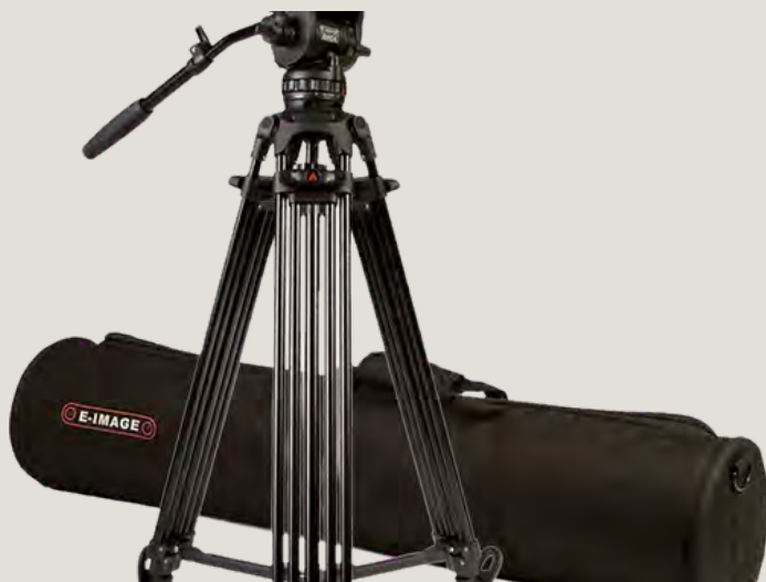
E-Image EG10C2 Medium Tripod 60,000 UGX