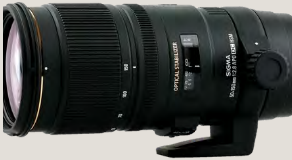
Sigma 50-150mm f/2.8 II EX DC HSM 50,000 - 70,000 UGX

Nikon F-Mount Lens is a compact, lightweight, large aperture telephoto zoom lens designed exclusively for APS-C digital SLR cameras. The version II of this high-quality lens has been optimized with an even better optical design, which provides optimum lens performance providing excellent correction for flare, ghosting and all types of aberrations. The super multi-layer lens coating reduce flare and ghosting and ensure sharp images throughout the entire zoom range.