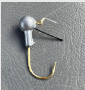
"curly tail jig"

Until the surface temperatures drop below 45 degrees, loads of fish can be caught in the fallen treetops on weedless curly-tail jigs or using live minnows between 6 to 10 feet deep. Once the water temps drop below 45 degrees, most of the crappie will migrate to deeper water (15 feet or more) where a "bottom technique" can be used. This involves using two 1/8-ounce jigs, spaced about 2-feet apart and tipped with live minnows. Drop the jigs to the bottom and reel up until the lower jig is just off the bottom. Slow troll (less than 1 mph) until you feel the distinctive "TAP" on the line and you've got 'em! So bundle up, grab a bucket of minnows and be prepared for some exciting wintertime crappie fishing. Good luck and we look forward to the fish fry!