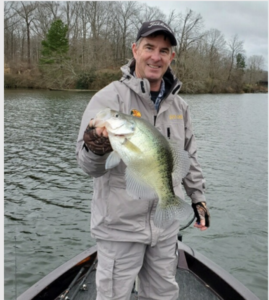
The author and some winter fishing.

When most people think about crappie fishing around Woodland Lake, they typically focus only on the springtime spawning season. However, these anglers are missing out on some of the most productive and consistent times to harvest these delicious fish. Once the surface water temps start to dip in the fall, the crappie will head to the fallen treetops to start feeding in preparation for the cold winter months. During this time, the crappie are only interested in feeding, as opposed to the spring when their main goal is trying to spawn. Crappie do not like sudden springtime changes in conditions, such as influxes of heavy rains, creating muddy water, or a rapid drop in water temperature. In the fall and winter, crappie are much less affected by these changes.