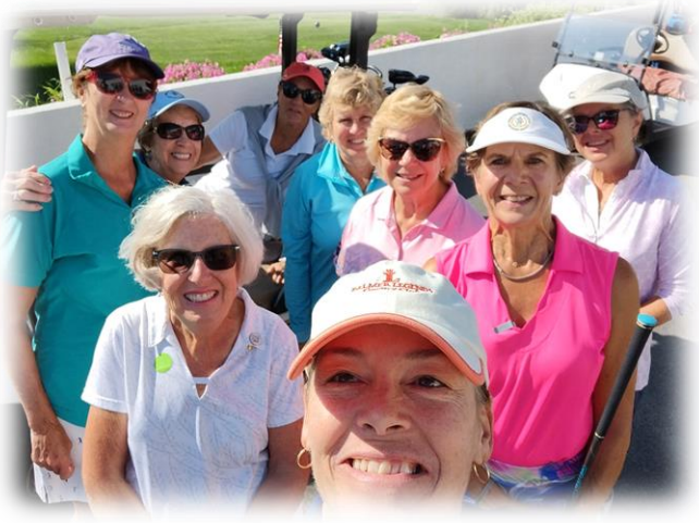
Ptarmigan Girls Doing Friday Golf