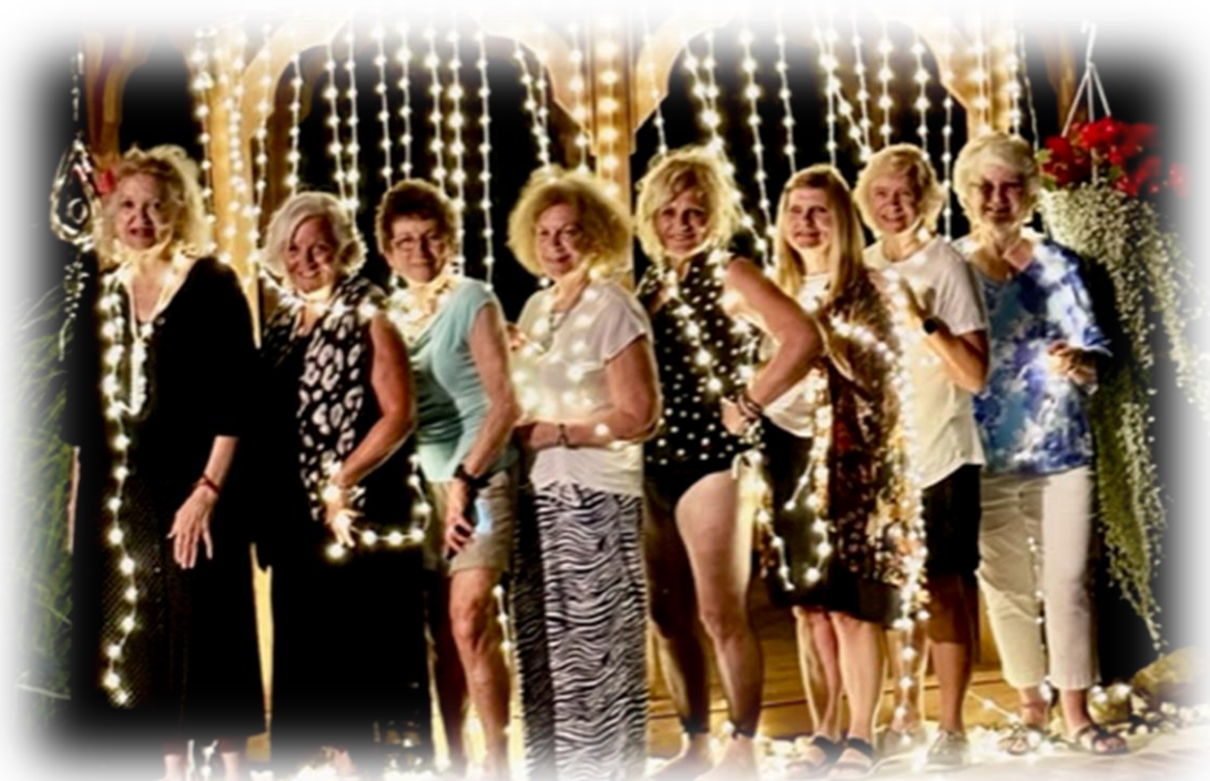
Ptarmigan All-Star Dance Lineup