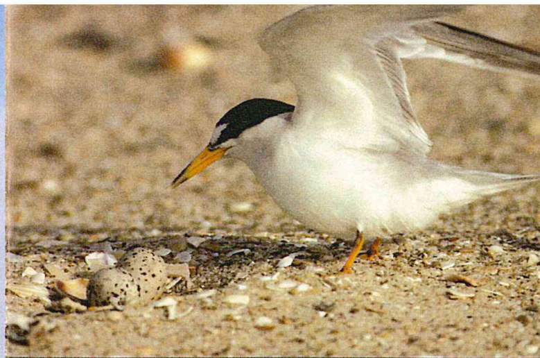
Eggs & chicks are perfectly camouflaged to match their sandy environment.