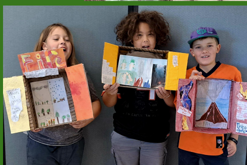
Poetry Boxes made by Elementary students displayed at the Public Library