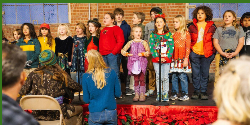
Jingle & Mingle Singing!