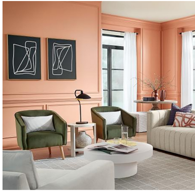
Persimmon by Sherwin-Williams