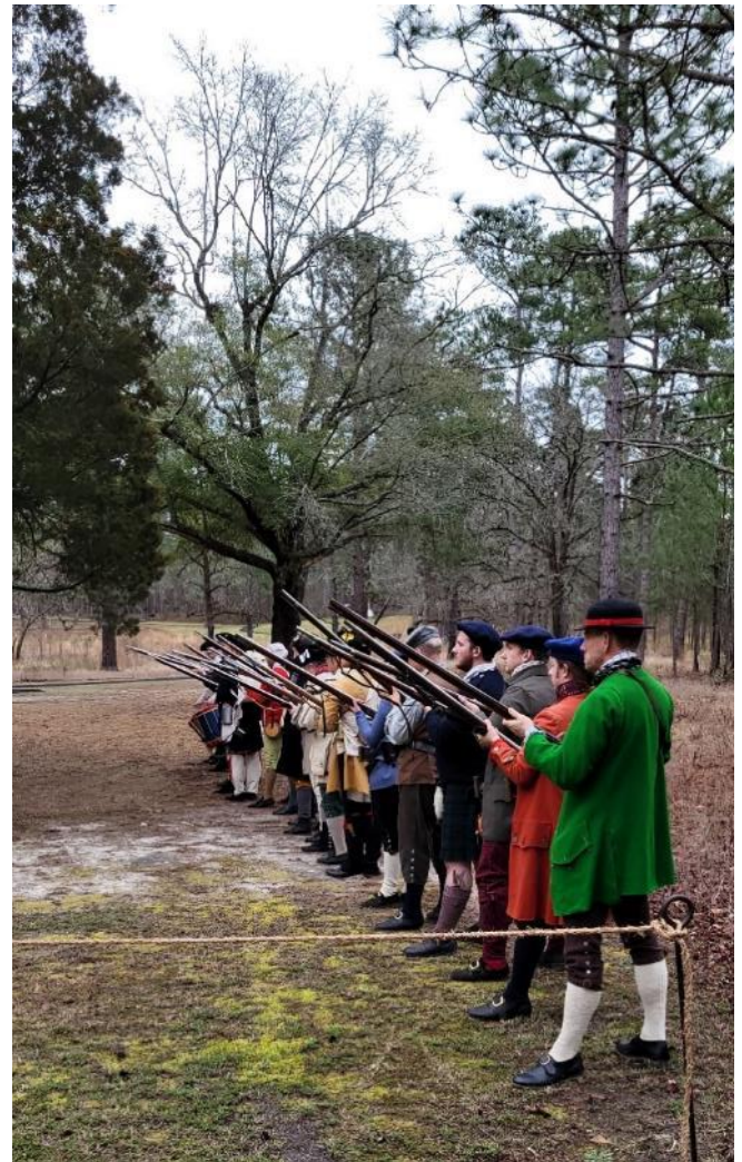
Moore's Creek National Battlefield February 2023

https://scottishheritageusa.org/2023-scottish-heritage-sunday-buffet/