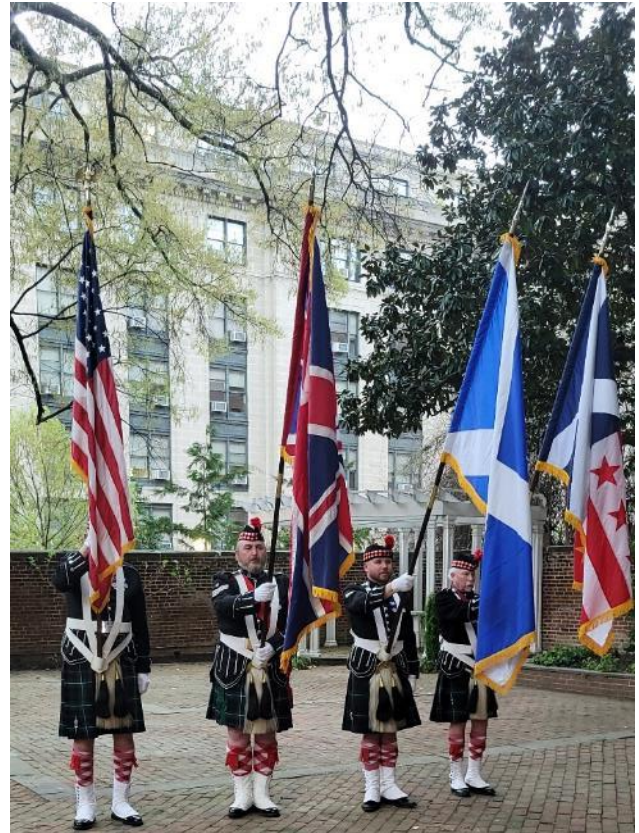
Washington DC Color Guard