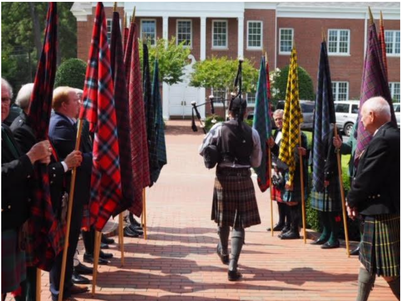
Kirkin' Exit, Brownson Memorial Presbyterian Church, 2019