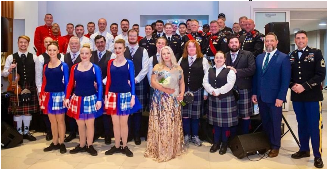
Performers at Tattoo at the British Embassy