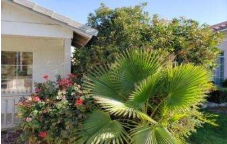
Clear away vegetation as needed

Color of selection below will indicate the level of concern for each area at time of inspection