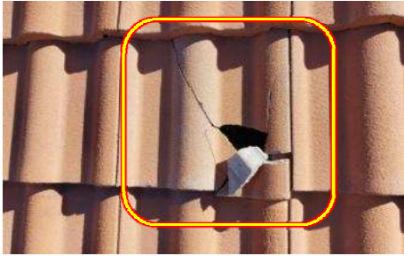
Damaged/displaced roofing tiles

Further Comments: There were damaged and displaced roofing tiles observed on the roof structure at time of the inspection. Recommend further evaluation and corrective repair or replacement as necessary from a qualified roofing contractor.