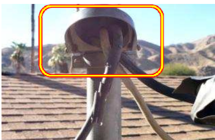
Masthead insulator grommet was damaged/missing