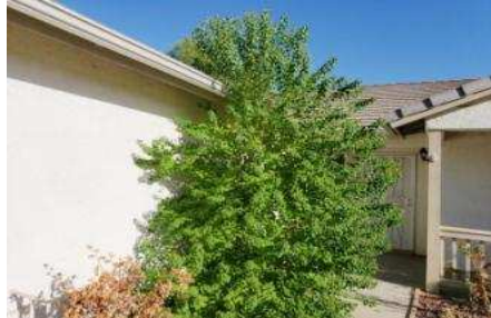
Clear away vegetation as needed