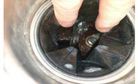
Dishwasher during drain cycle