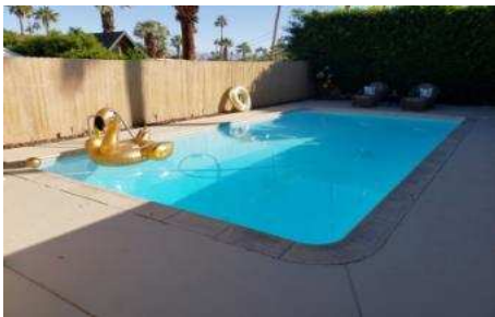
View of decking