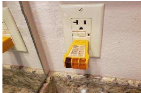
GFCI outlet not responding correctly