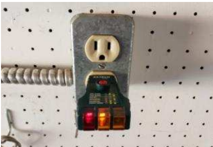
Reversed polarity outlet in garage

Observation: • There were outlets in garage next to the work bench that tested with reverse polarity. This happens when the hot live wire (black or red wire) and neutral wires (white wire) get flipped around at an outlet or switch. Reversed polarity creates a potential shock hazard. Recommend further evaluation and corrective repair in accordance with accepted practice. • GFCI electrical outlet in the master bath did not respond correctly when tested and should be repaired or replaced as necessary for safe and proper function. A GFCI outlet also known as "Ground fault circuit interrupter device" is to add additional protection against electrical shock or electrocution. It's designed to detect very low levels of electrical current leaks (ground faults), and acts quickly to shut off power, preventing serious shock.