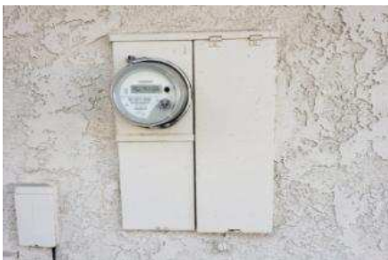
Main service panel