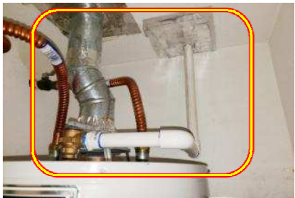
TPR pipe improper/runs uphill