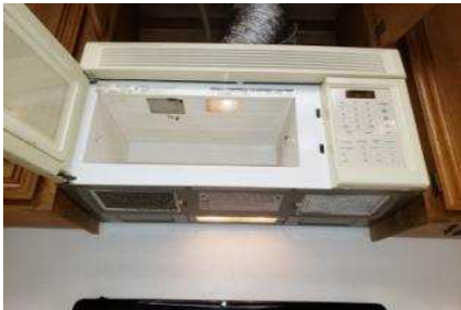
Fan and light were functional

The exhaust vent ducting in the overhead cabinet was using a soft flex ducting. This type of ducting is improper for this type of application and should be a rigid ducting that is designed for this type of use. Recommend corrective repair as necessary in accordance with the manufactures installation instructions.