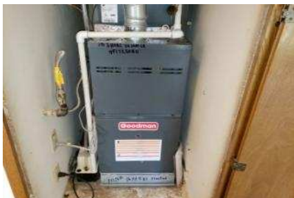
Furnace was functional

The heating system responded as designed when using the thermostat operating controls and delivered sufficiently conditioned heated air to the supply outlets at time of the inspection. Sample photos below show temperature readings at random supply outlets during operation of heating system. Due to the limits of this visual inspection this inspector recommends having the heating system serviced as per the manufactures recommendations and any corrective service that may be needed.