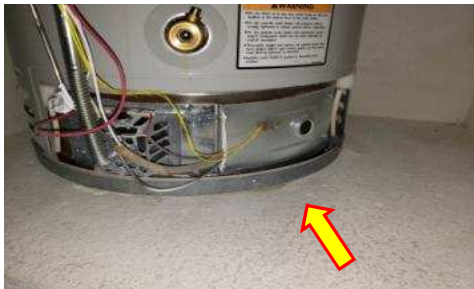
Missing drain pan