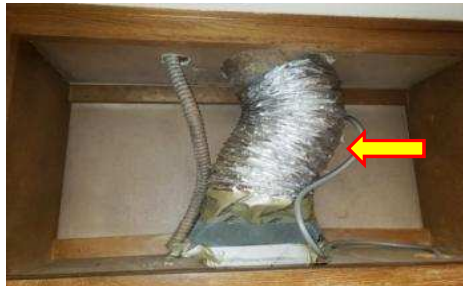
Improper exhaust vent ducting