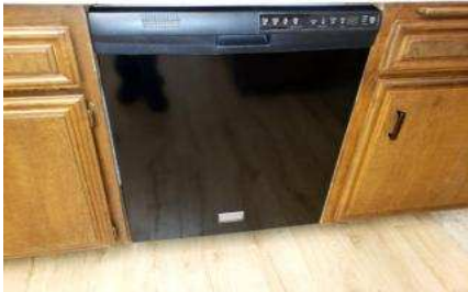
Dishwasher was functional

Color of selection below will indicate the level of concern for each area at time of inspection