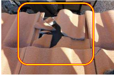
Damaged/displaced roofing tiles