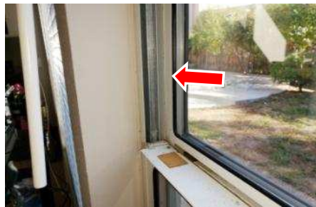
Window balancers were damaged