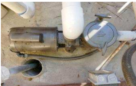
Pump was functional