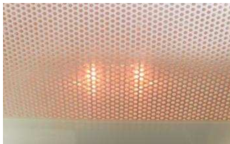
Microwave tester tested functional