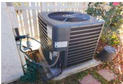
AC compressor was functional

The air-conditioning system responded and achieved an acceptable differential temperature split between the air entering the system and the air coming out at time of the inspection. Sample photos below show temperature readings at random supply outlets during operation of cooling system. Due to the limits of this visual inspection this inspector recommends having the cooling system serviced as per the manufactures recommendations and any corrective service that may be needed.