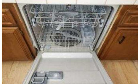
Dishwasher during operation