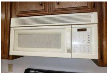
Microwave was functional