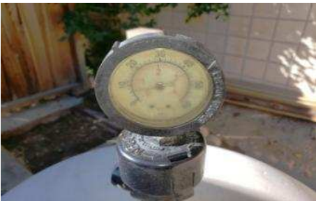
Pressure gauge on filter