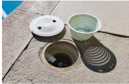
Skimmer and basket