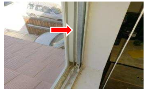
Window balancers were damaged