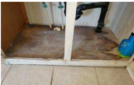
Stain and discoloration inside cabinet

Further Comments: There were stained and discolored areas inside the kitchen cabinet. This condition typically indicates a moisture caused problem. The source of moisture should be identified and the condition corrected. Recommend further evaluation and corrective repair as necessary.