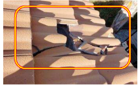
Damaged/displaced roofing tiles