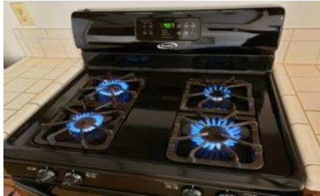
Burners were functional