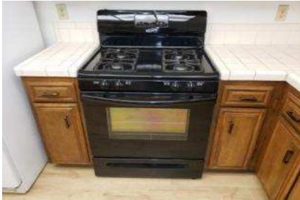
Gas range was functional