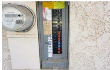
Breakers were labeled