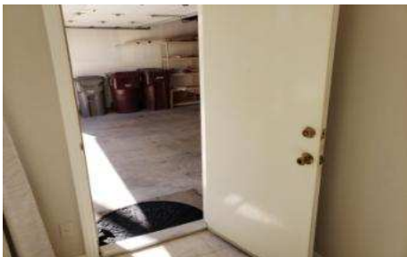
Fire door closure was inoperable

Further Comments: The garage service door entry to home was not operating as designed. It is a fire door that is designed to close and latch automatically from a fully open position to serve as a protective barrier in the event of a fire. Recommend corrective repair as necessary.