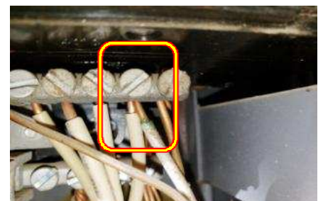
Neutral (white) wires were doubled or bundled together