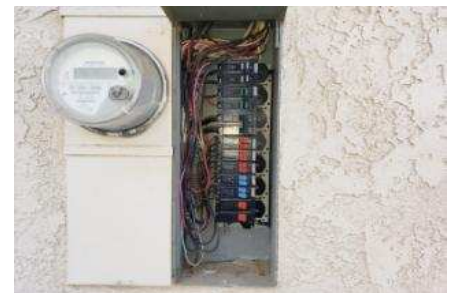
View inside main electrical service panel