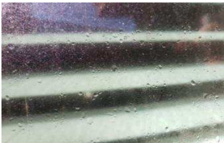
Moisture between glass panes

Further Comments: • At time of the inspection there were one or more windows observed with a staining and condensation between the window glass panes. This condition typically indicates a failed seal. Recommend further evaluation from a qualified window specialist and serviced according to their recommendations. Locations observed were family room and the master bedroom. • There were hung type windows that will need service as the balancers have come out of the window assembly. Balancers are the spring type mechanisms that are a necessary component to assist in the operation of vertical or hung type windows. Locations observed were dining room and family room.