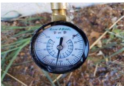
Water pressure tested to high

The home water supply pressure exceeded the 80 psi limit considered the maximum allowable by generally-accepted current standards (water pressure tested at 105-115 psi). Excessively high water pressure is likely to cause leaks if not corrected. Recommend a qualified plumbing contractor for corrective action.