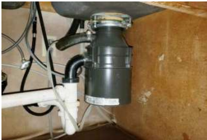
Garbage disposal was functional

This Home Inspection Field Report is confidential and has been produced in accordance with our signed contract agreement and is subject to the terms and conditions agreed upon therein.