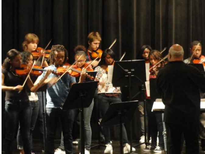
McCluer South-Berkeley and McCluer North High Schools combine forces for a powerful effect.