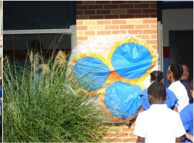
Viewing a sculpture in the garden