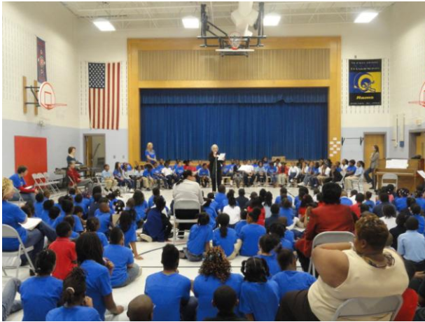
Highland students at concert