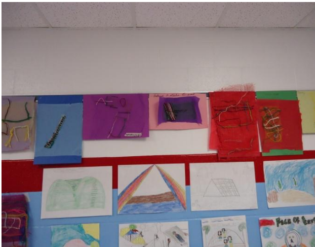
Weavings and drawings inspired by sculptures at Laumeier Sculpture Park