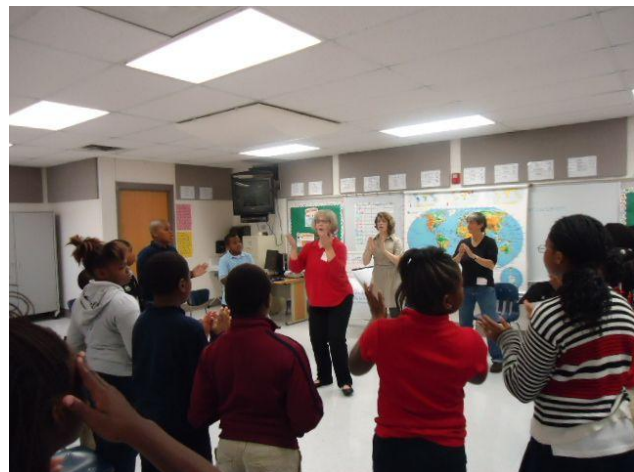
In the music room learning (left) Hied, Shudders, Knees and Taes ; (right) learning Cucanandy