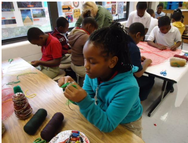
In the art room creating plastic sculptures and weavings