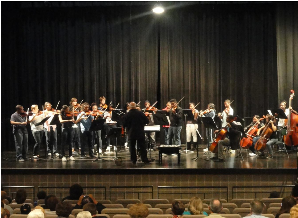
McCluer High School Orchestra